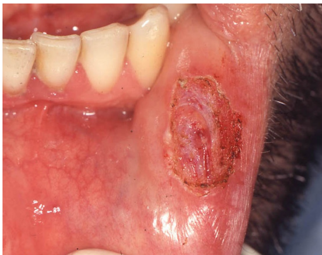
Figure 2 Clinical appearance of the surgical scar 10 days after surgery. The use of a diode laser with a 300 \mu\text{m} fibre and operating at 2,5 W allowed prompt recovery of the patient, with no inaeesthetic alterations of the adjacent tissues.

admixture of mature adipose tissue, including variably sized typical adipocytes, embedded within dense collagen fibres (Fig. 3), consistent with fibrolipoma. Regressive changes of the tissues located at the surgical margins, such as cellular hyperbasophilia, nuclear chromatin condensations or tissue coarctation were not detected.