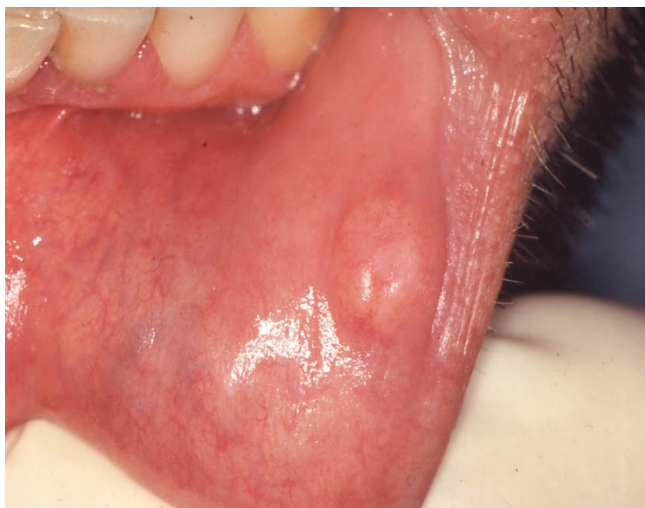
Figure 1 Clinical appearance of fibrolipoma. This lesion usually presents as an asymptomatic swelling of soft consistency, mobile on the surrounding tissues.

admixture of mature adipose tissue, including variably sized typical adipocytes, embedded within dense collagen fibres (Fig. 3), consistent with fibrolipoma. Regressive changes of the tissues located at the surgical margins, such as cellular hyperbasophilia, nuclear chromatin condensations or tissue coarctation were not detected.