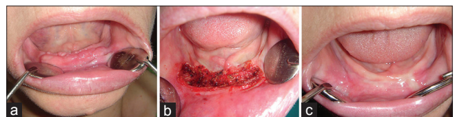
Figure 1: (a) Preoperative view of the epulis fissuratum lesion of a patient, (b) immediate postoperative view of the treated area, (c) view of the treated area two weeks after diode laser intervention

Four patients with pyogenic granuloma, diagnosed